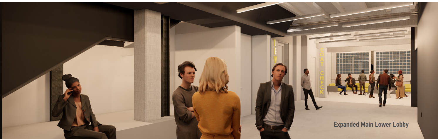
Expanded Main Lower Lobby